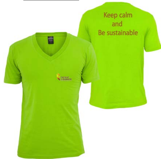
Item 4 - MEBP T-shirts **