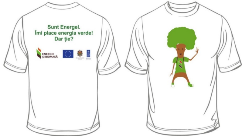
Item 2 - T-shirts (unisex) Energel