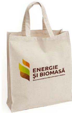
Item 1 - Cotton bag