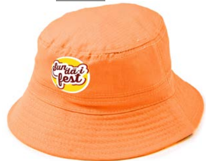
Item 6 - Sun Hat