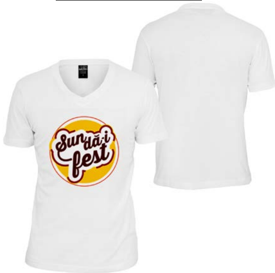
Item 3 - "Sun Da-I Fest" T-shirts **