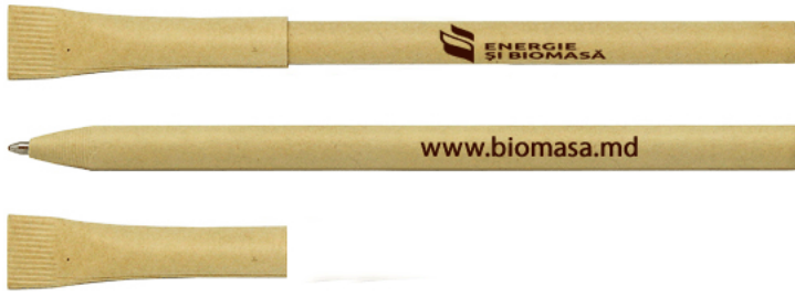
Item 9 - Pens