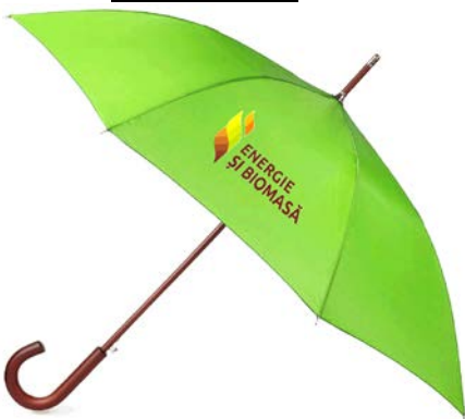
Item 7 - Rain Umbrella